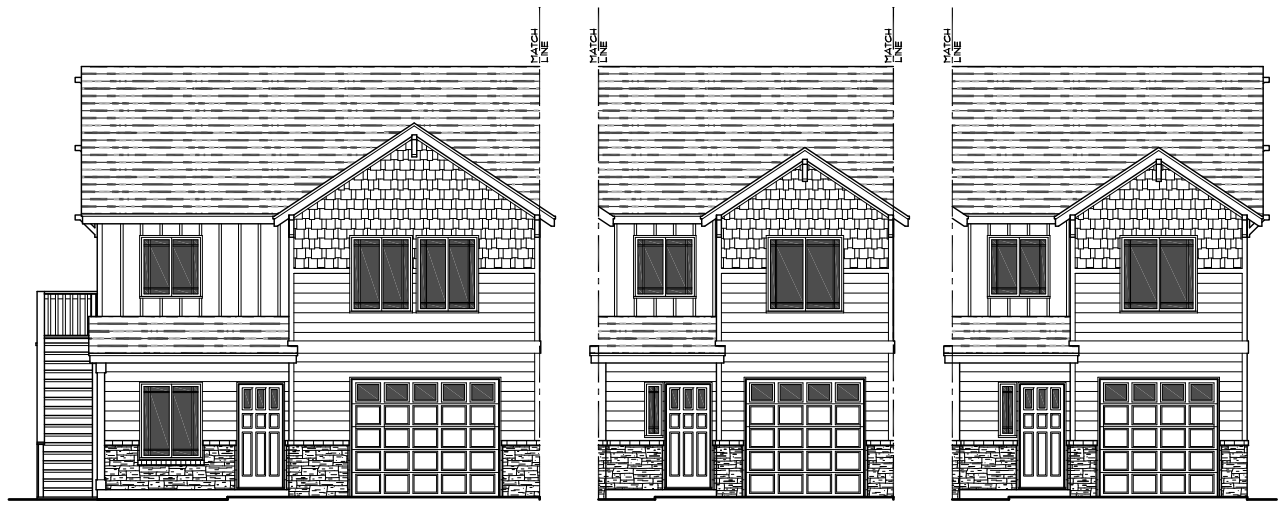
Front Elevation "Unit D & E"