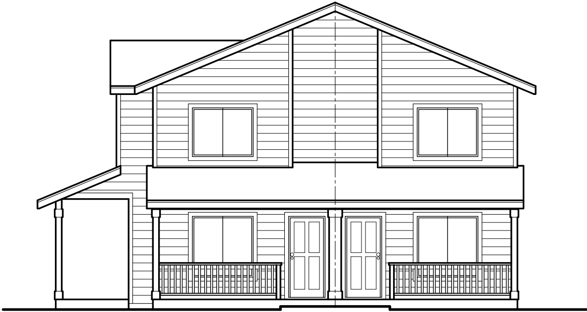
FRONT A ELEVATION