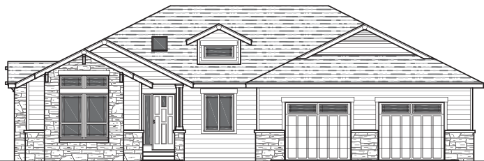
Plans match 2d elevation, rendering is from sym. plan 9943