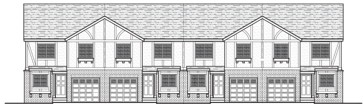
23'-0" each unit 92'-0" total 4 units