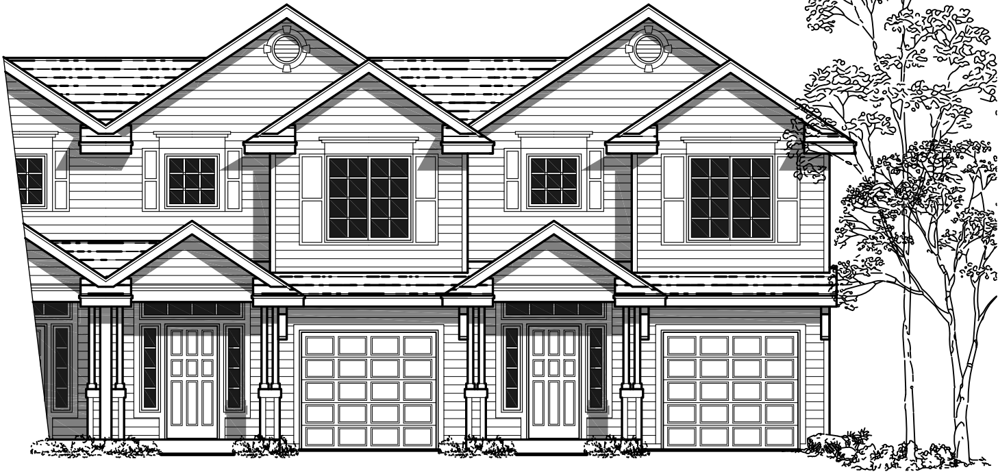
D-467 is 2 units, T-412 is 3 units, F-566 is 4-units