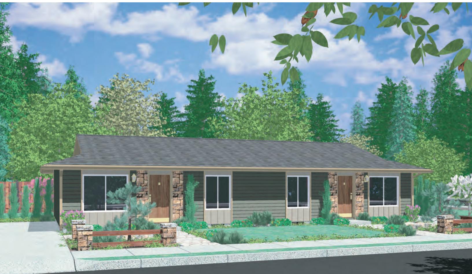
PLAN #D-024 EACH UNIT 784 SQ. FT.